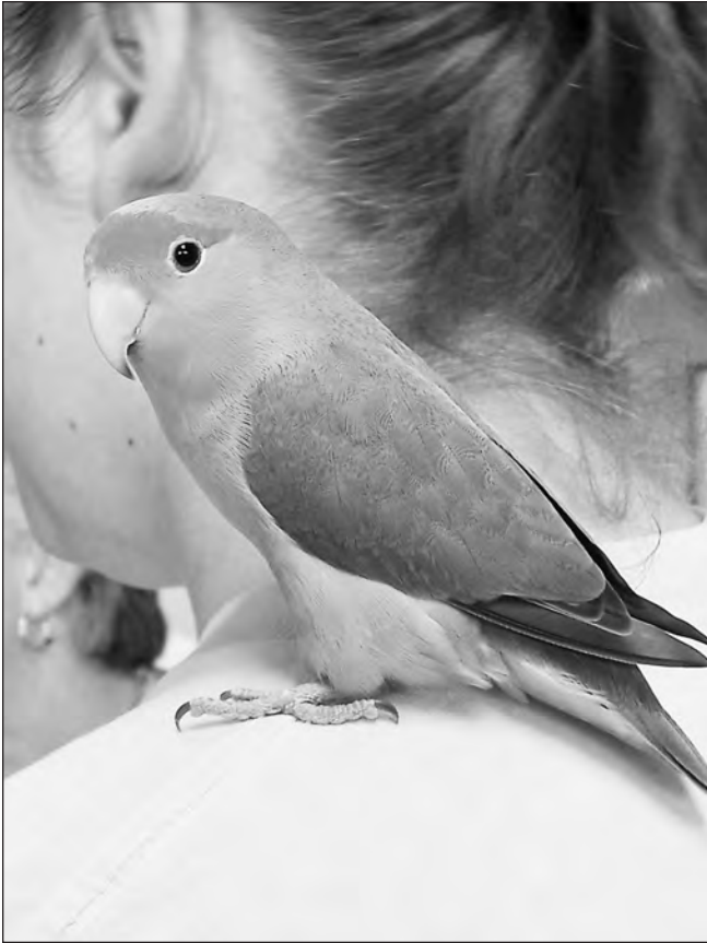
Putting loose hair up eliminated the cues for the occurrence of the undesired behavior.