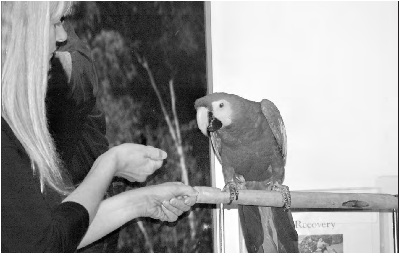
Wrapping the step up hand into a fist can increase confidence if a bite is anticipated.