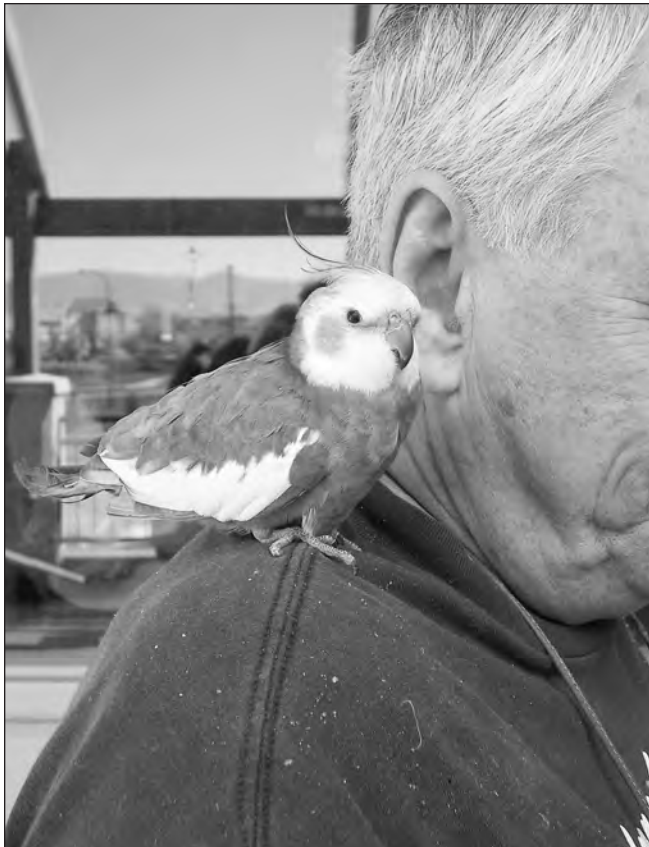
Sometimes attempting to remove the bird from the shoulder resulted in a bite.