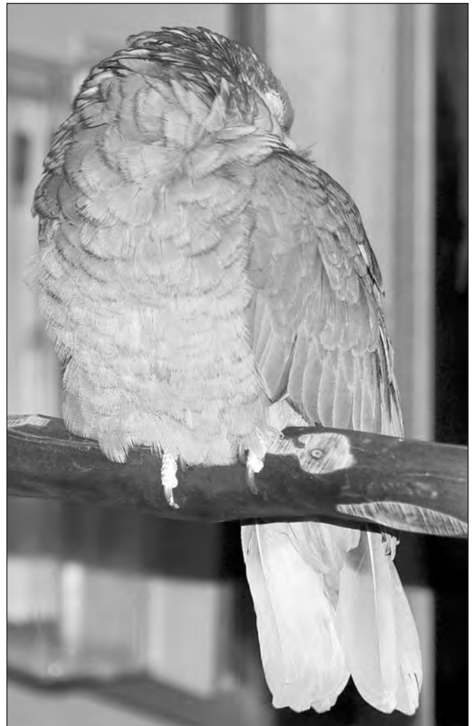
Improving sleeping arrangements can reduce nipping associated with fatigue.