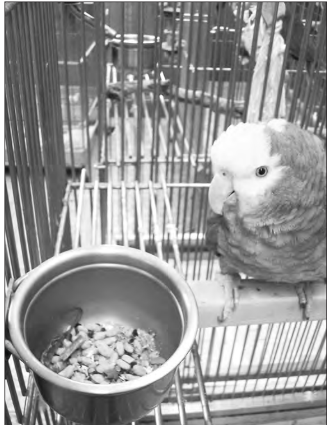
Calmly perching elsewhere when bowls are replenished is another ultimate desirable replacement behavior.

A particular vocalization Sunshine makes can replace biting and serve the same function of saying “No thanks!” to remove hands.