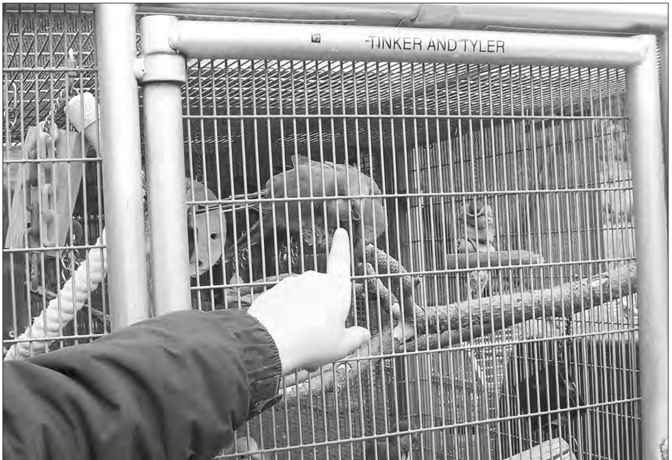
Poking and tapping the bird's beak through the bars may have increased biting behaviours.